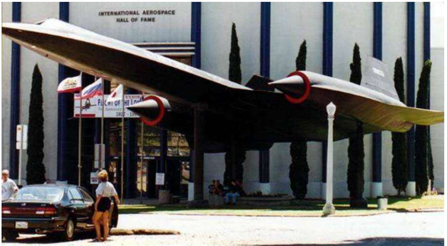
San Diego Aerospace Museum

It was a key factor in winning the Cold War.